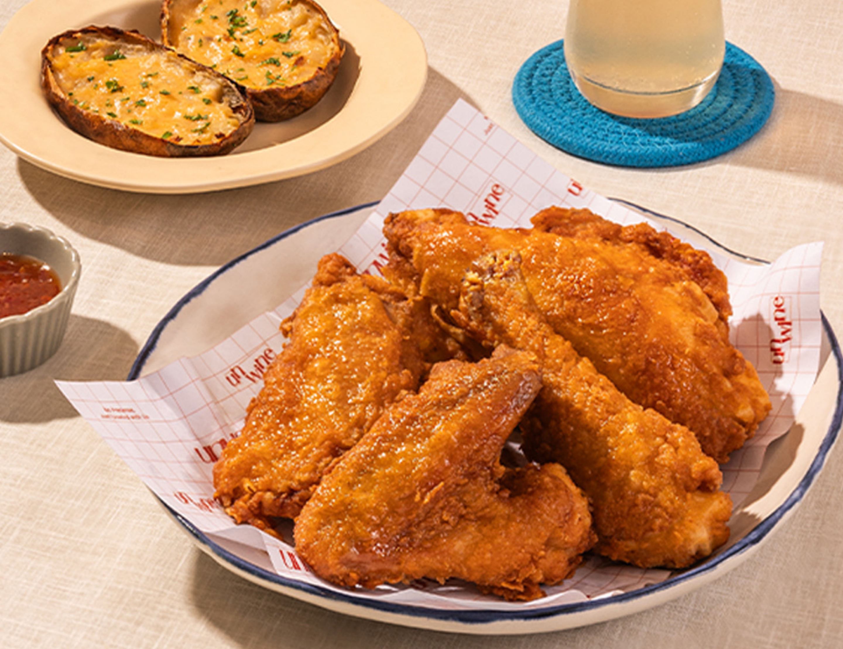
Fried Chicken Served with Coleslaw

Timeless classics you always come back for