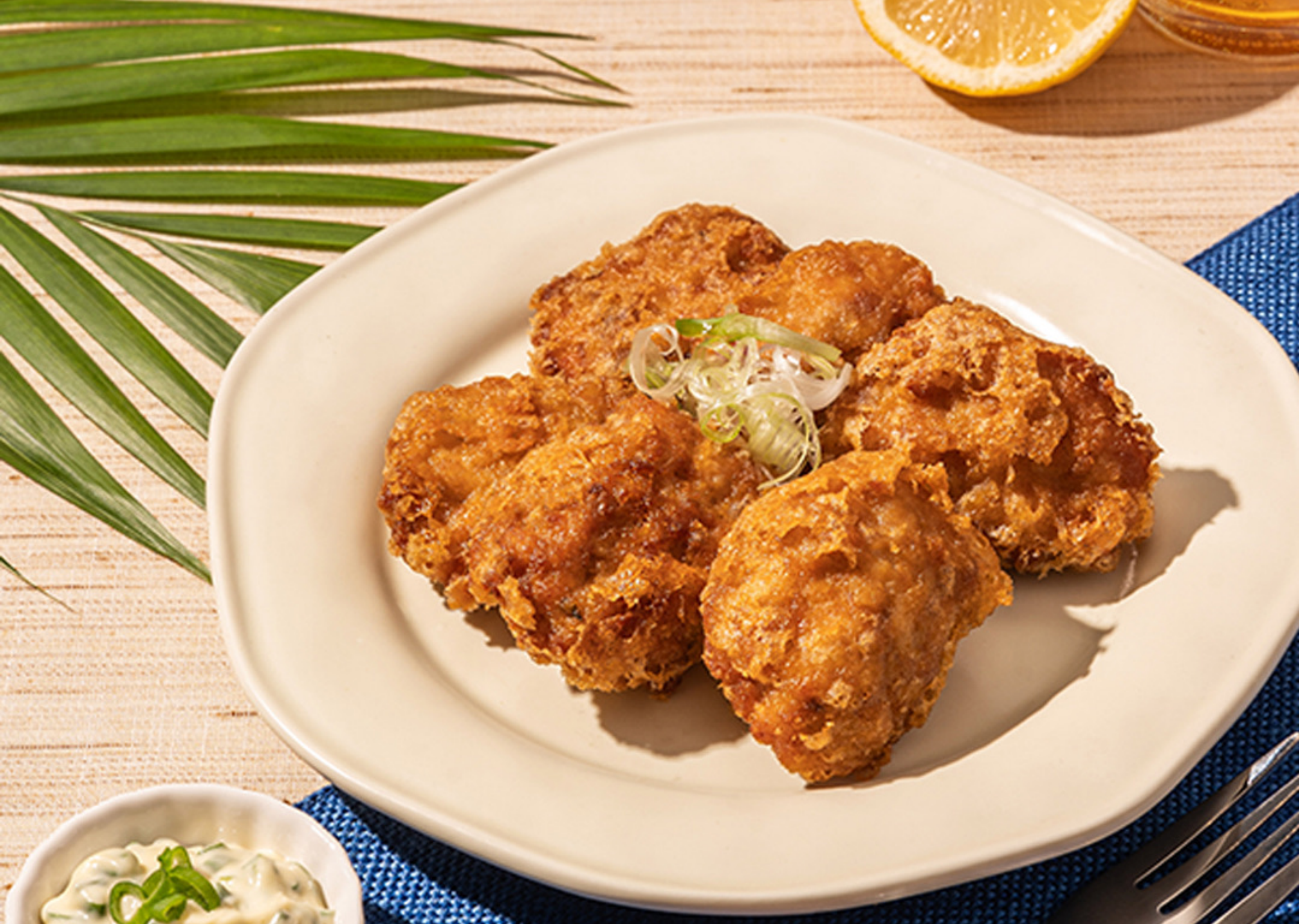
House Made Chicken Nugget

Slow-cooked Duck Leg, Delicately Seasoned and Confited until Tender, Finished with A Golden Crispy Skin