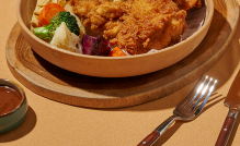
3pcs Fried Chicken | Mixed Grilled Vegetables | French Fries