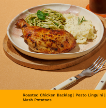
Roasted Chicken Backleg | Pesto Linguini | Mash Potatoes

Chicken Curry Thai Green Chilli Gochujang Mayo Onion Gravy Crispy Chilli Mayo