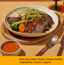
Red Wine Beef Cheek | Mixed Grilled Vegetables | Pesto Linguini