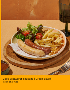
2pcs Bratwurst Sausage | Green Salad | French Fries