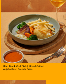
Miso Black Cod Fish | Mixed Grilled Vegetables | French Fries